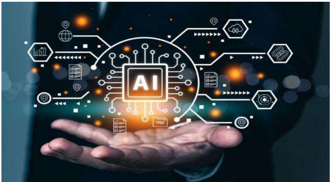
Fig. 1. Artificial Intelligence